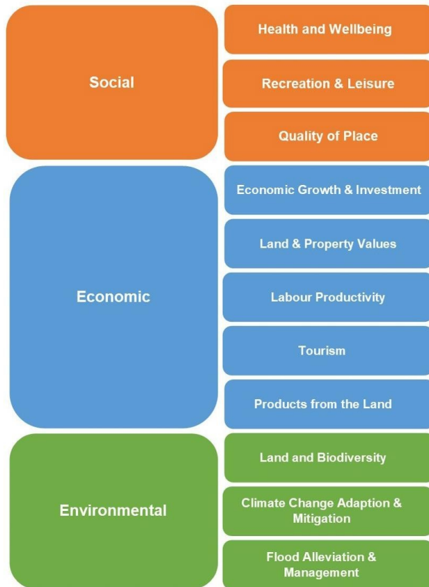
Figure 1 Green infrastructure contribution to sustainable development

and Clean Air Zones, and the cumulative impacts from individual sites in local areas. Opportunities to improve air quality or mitigate impacts should be identified, such as through traffic and travel management and green infrastructure provision and enhancement. So far as possible these opportunities should be considered at the plan-making stage, to ensure a strategic approach and limit the need for issues to be reconsidered when determining individual applications.