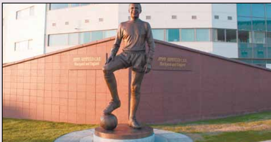
Standing proud: the new Jimmy Armfield statue

Speaking at the official unveiling Mr Armfield said he was honoured that Blackpool FC fans and the whole town had made such an effort to recognise him.