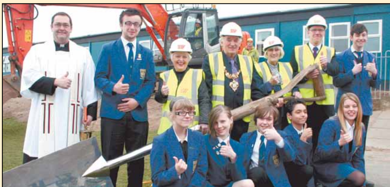
Highfield Humanities College pupils help mark the start of work.