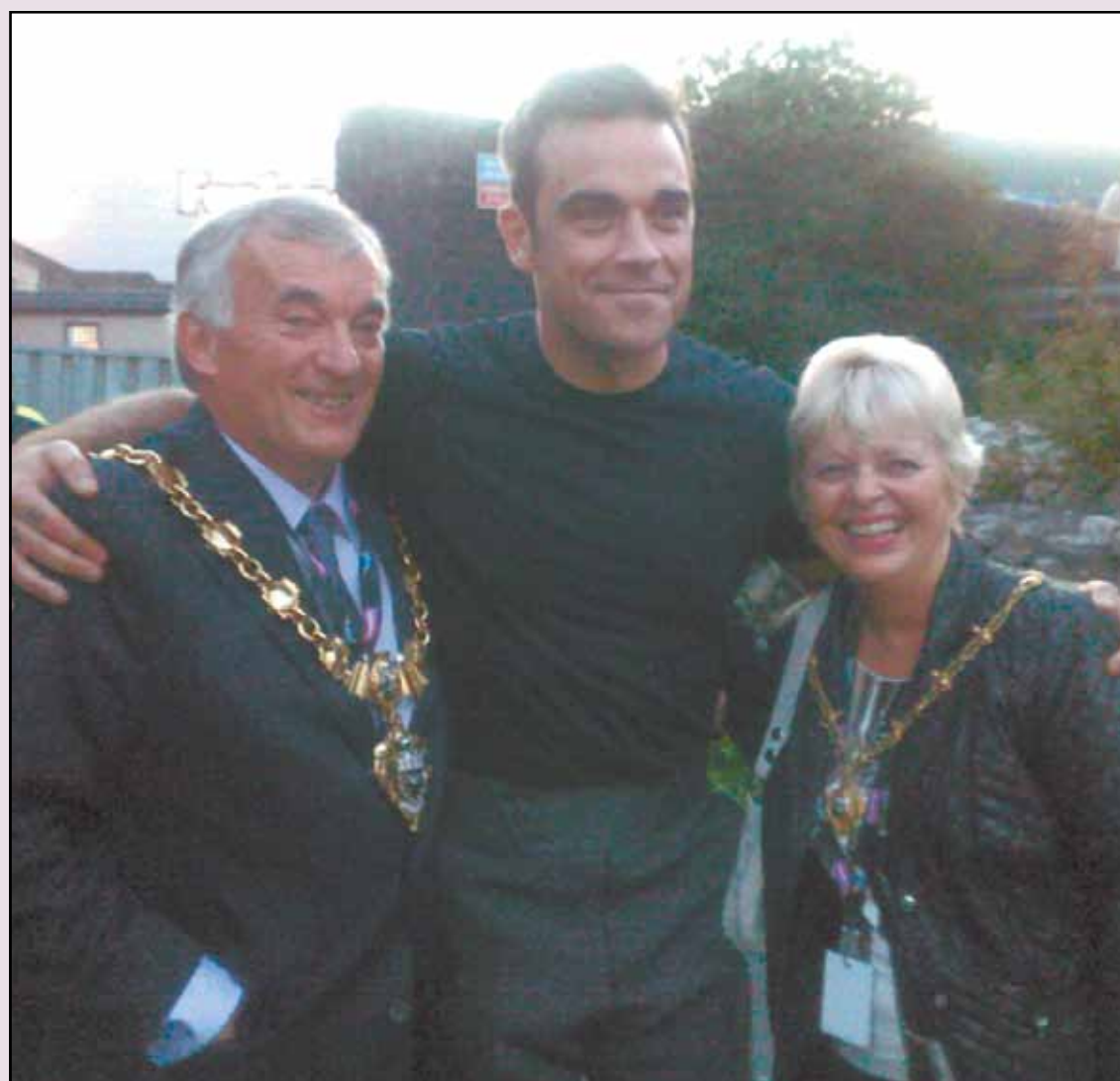
All in a day's work - meeting Robbie Williams

The Worshipful Mayor of Blackpool has nominated Brian House Hospice as her charity of the year, along with Easterleigh Animal Sanctuary and Cats Paw Sanctuary - two charities