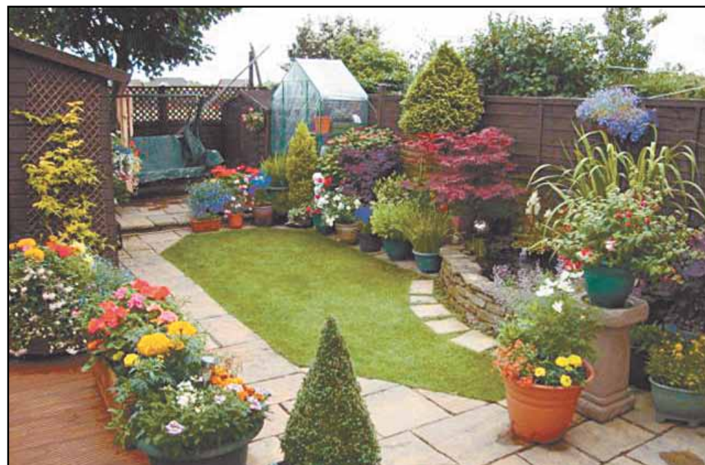
A previous entry

Entry forms can be collected from Customer