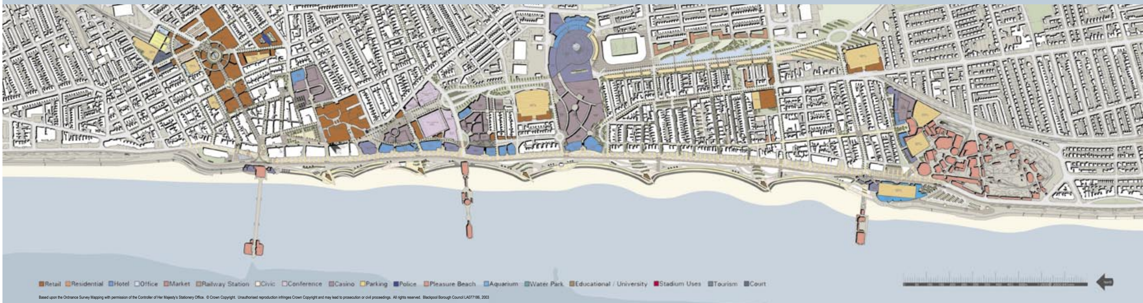
Retail, Residential, Hotel, Office, Market, Railway Station, Civic, Conference, Casino, Parking, Police, Pleasure Beach, Aquarium, Water Park, Educational / University, Stadium Uses, Tourism, Court

"The masterplan has the courage to adopt the spirit of the existing town by going for future developments which may be as extraordinary and inspirational as the existing." Urban Panel Report, Feb 2003