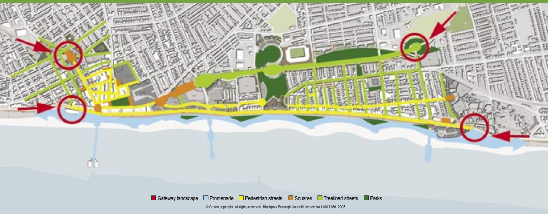
Gateway landscape, Promenade, Pedestrian streets, Squares, Treelined streets, Parks