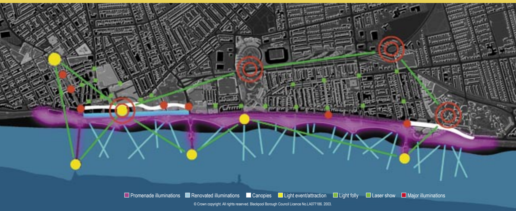
Promenade Illuminations, Renovated Illuminations, Canopies, Light event/attraction, Light tolly, Laser show, Major Illuminations

"The masterplan has the courage to adopt the spirit of the existing town by going for future developments which may be as extraordinary and inspirational as the existing." Urban Panel Report, Feb 2003