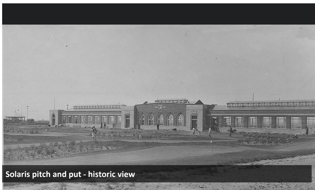
Solaris pitch and put - historic view

If you are interested in holding a conference with us please take a look at our conference facilities page for details or contact us directly on 01253 478020 or email solaris.centre@blackpool.gov.uk