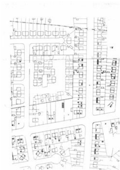
Detailed Tree Locations for TPO 13