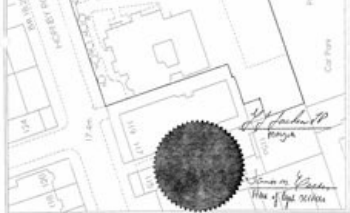
Location Plan showing Trees in TPO 30