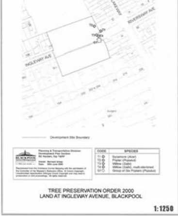
Location Plan showing trees in TPO 33