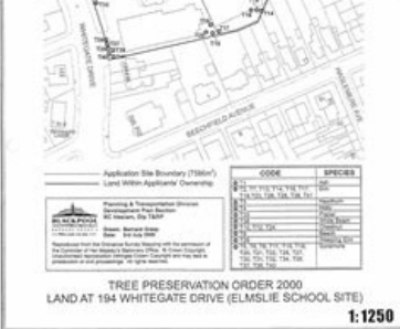
Location Plan Showing Trees in TPO 36

The Blackpool Borough Council in exercise of the powers conferred on them by sections 198, following 201, 203 Order: and