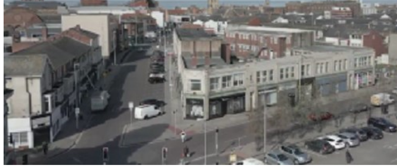
Above: Stanley Buildings