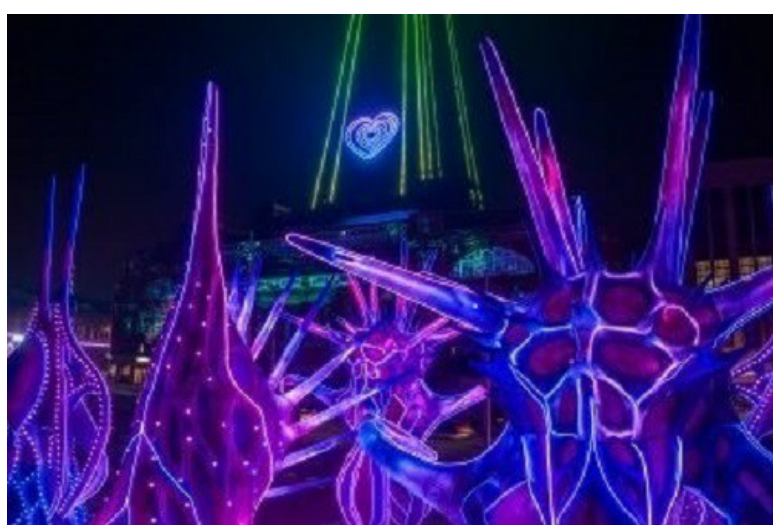
Above: The new Odyssey illumination feature

A number of new centrepiece attractions will be designed alongside new lighting infrastructure improvements and essential technical equipment needed to deliver the illuminations in a greener, more sustainable way.