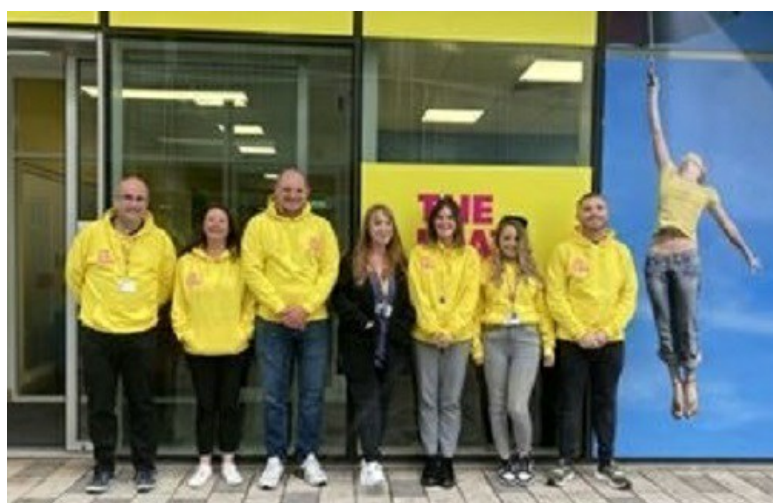
Above: The Platform team outside of The Platform Hub.

The Platform is located in a town centre unit within Bickerstaffe House, a council owned building.