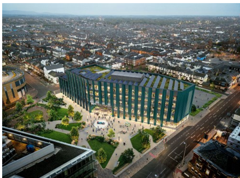
Above: Architect's Image of the Multiversity

The new multiversity campus has been designed to accommodate up to 3,000 staff and students.