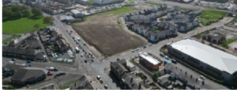
Above: Aerial view of the Community Sport Village Area.