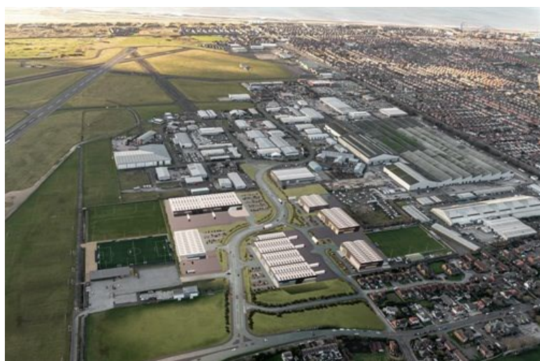
Above: Aerial view of the Blackpool Enterprise Zone.

Through the creation of new highways, the scheme will support business and jobs growth, opening up 10.5 hectares of previously inaccessible development land. This will support the aim of the Enterprise Zone to create 5,000 new jobs for the area by 2041.