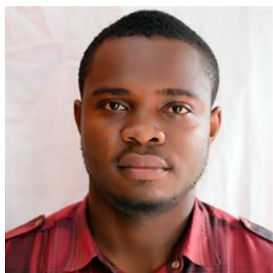
Senior Public Health Intelligence Analyst

"Before joining Blackpool Researching Together, I worked as a Public Health Pharmacist for several years. I have been involved in several data focussed population-level research that aims at addressing health inequalities in low resource settings especially amongst minority groups and underrepresented population".