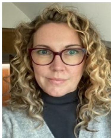
Consultant in Public Health

"I'm a Public Health Consultant and worked at Blackpool Victoria Hospital for the past three and a half years as the health inequalities and prevention lead. I have gained a deep understanding of the causes and impact of health inequalities on the people living in Blackpool. I hope to help the HDRC to embed evaluation in council services to make sure we are improving people's lives and ensure that we have the skills and knowledge to coproduce the evidence that is needed to support decision making."