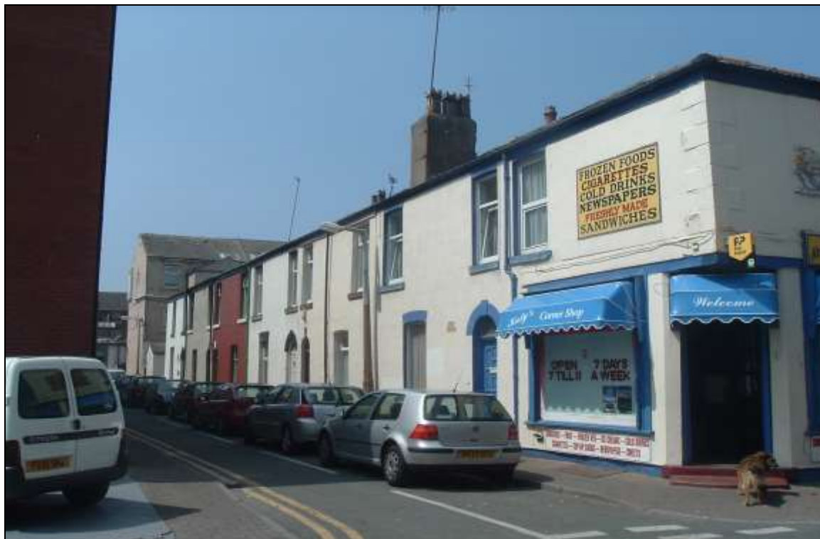
Bickerstaffe Street facing original site of drill hall