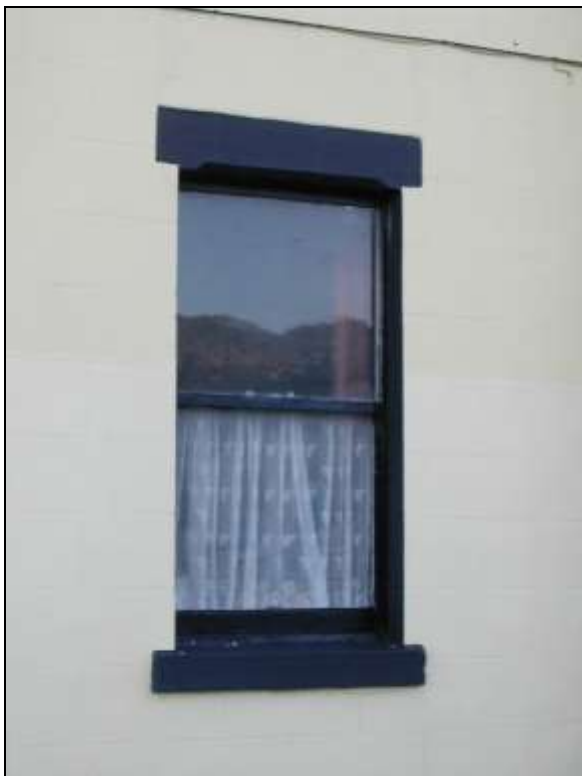
Original window Singleton Street