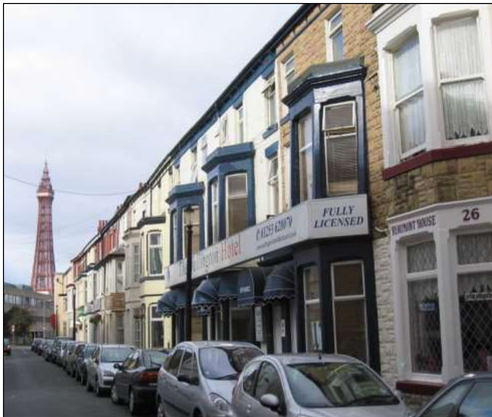
Example of lodging houses on Coop Street