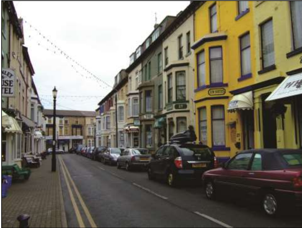
York Street looking East