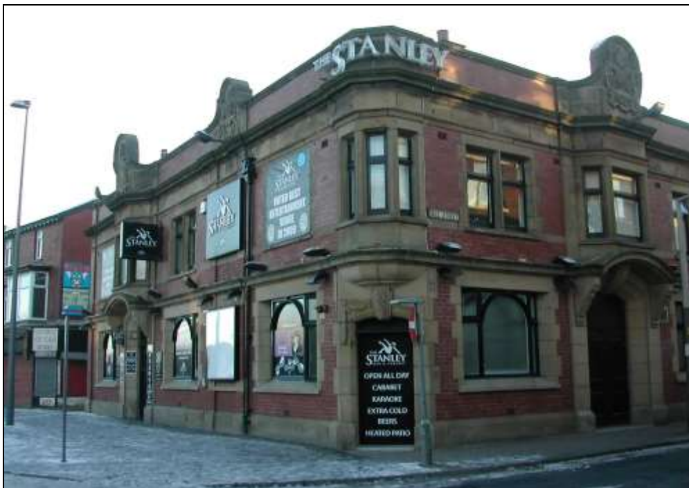
Stanley Arms, Chapel Street