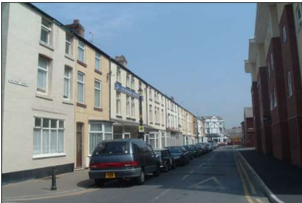
Shannon Street looking East