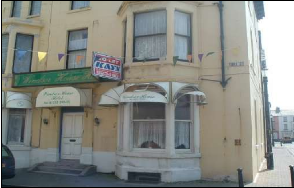
Original joinery, York Street