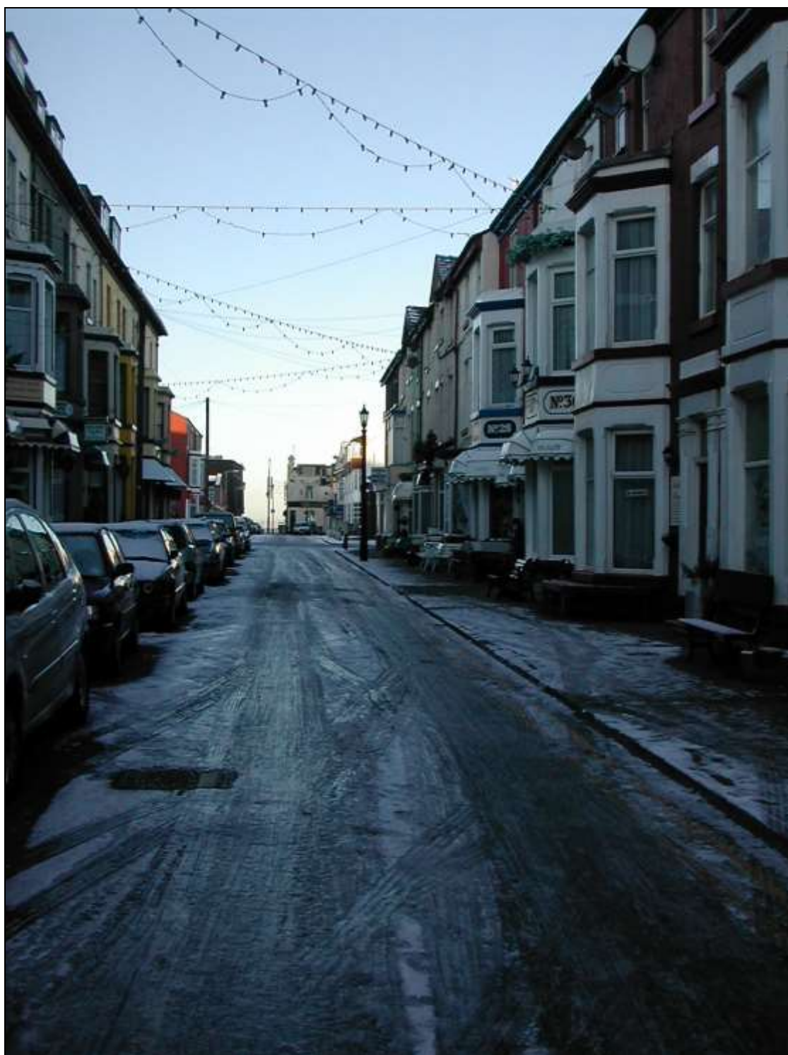
York Street looking West