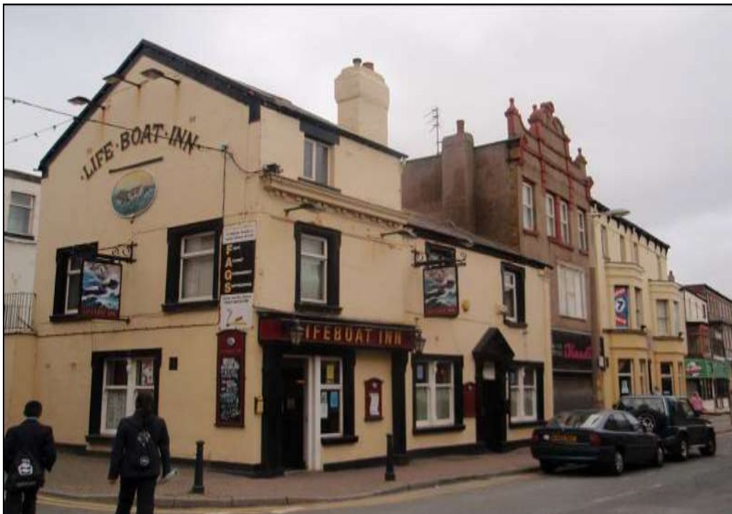
Lifeboat Inn, Foxhall Road