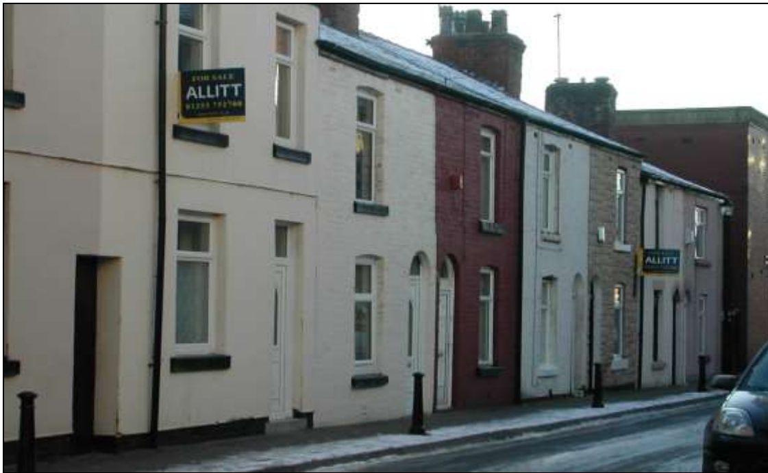
Caroline Street – Typical workers housing