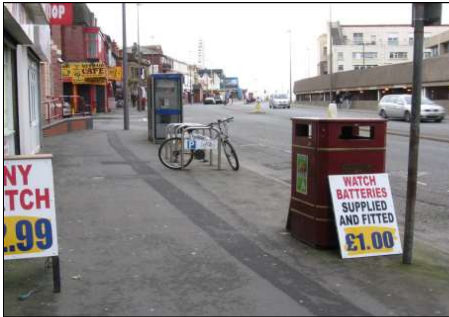
Tarmac surfaces and modern street furniture on Chapel Street