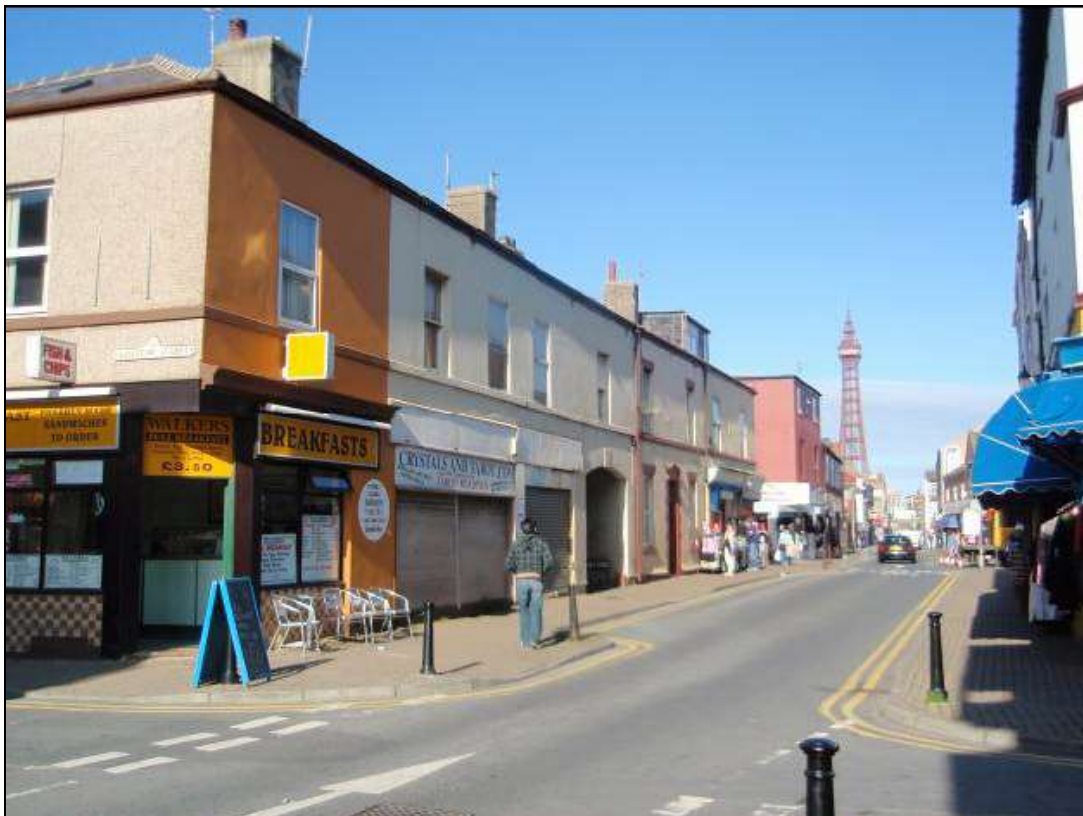
West side of Dale Street looking north from Bairstow Street