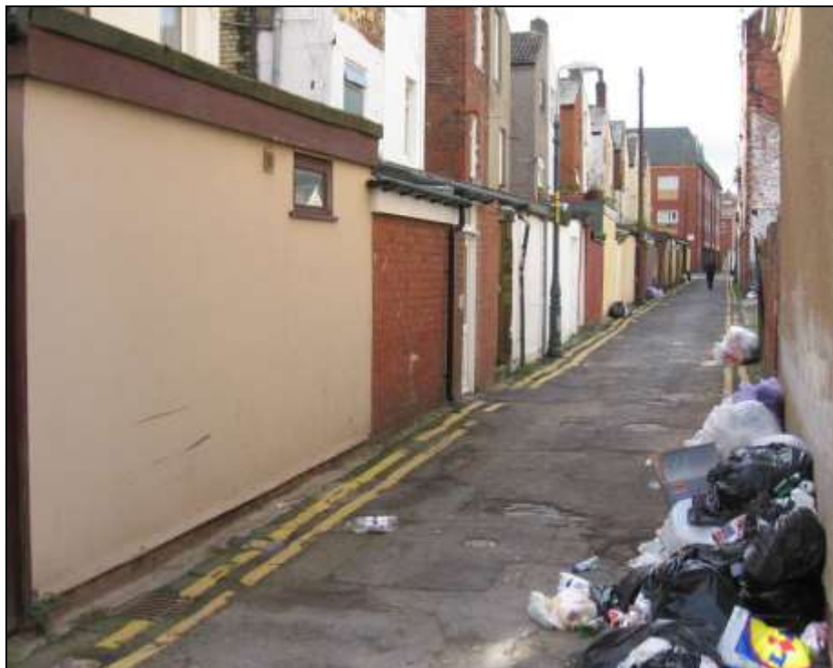
Alley off Coop Street