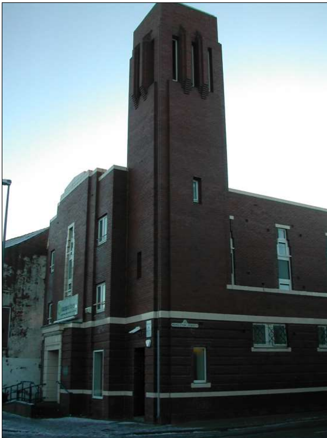
Methodist Chapel, Chapel Street