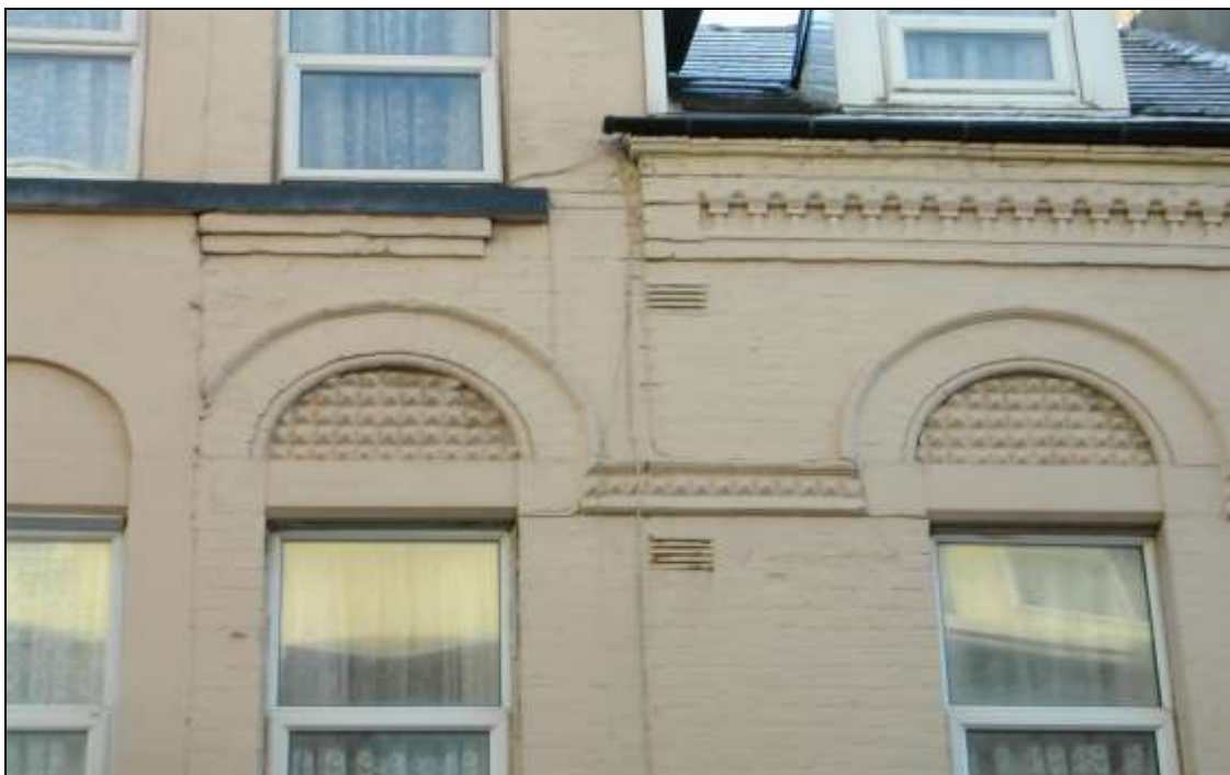
Terracotta details, now painted, Bairstow Street