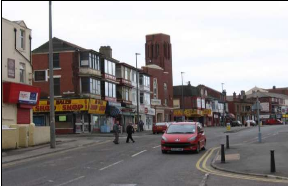
Chapel Street facing west