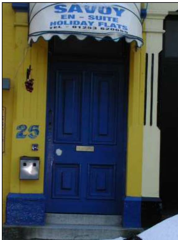
Original door and surround York Street