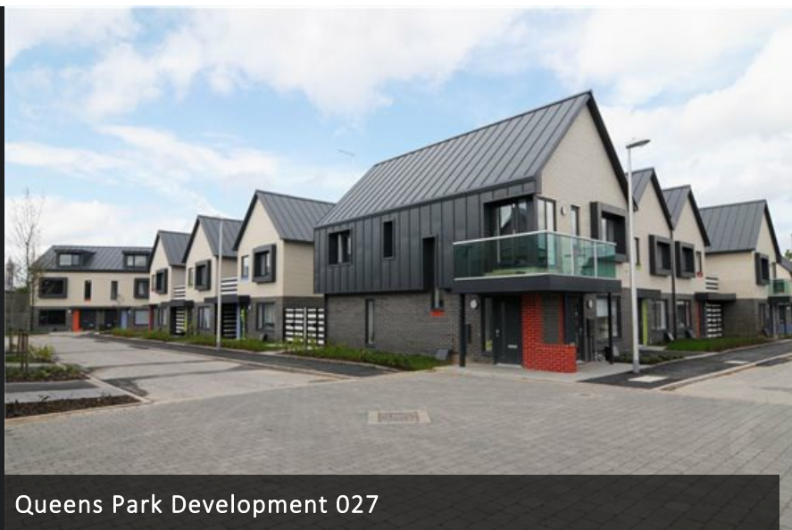
Queens Park Development 027

The development includes plans to build on part of 'Layton Rec'. This will be balanced by bringing new green space into the heart of the Queens Park estate. As part of the re-development work, funding has been put aside to improve 'Layton Rec' for the benefit of all the residents in the area.