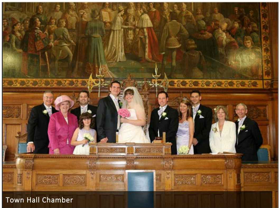
Town Hall Chamber