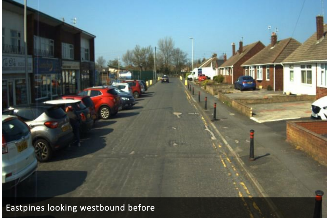
Eastpines looking westbound before