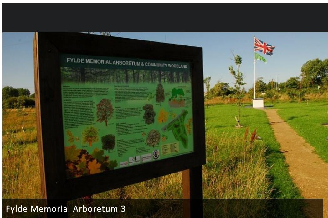
Fylde Memorial Arboretum 3