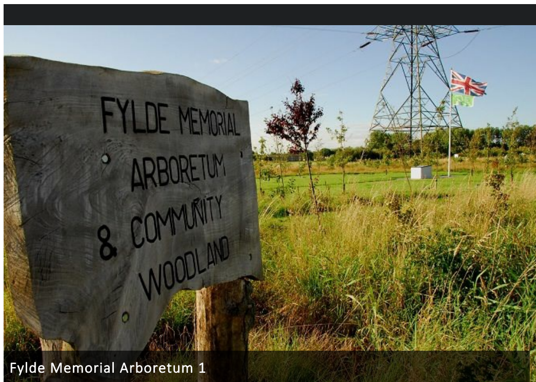
Fylde Memorial Arboretum 1