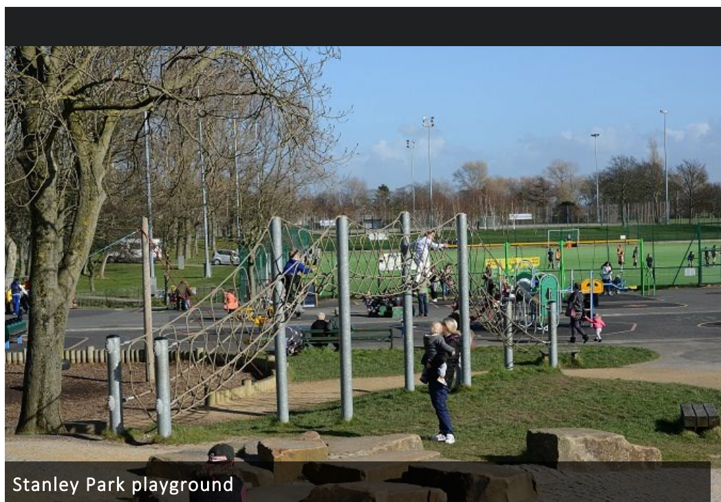
Stanley Park playground

For any queries relating to Blackpool Sports Centre/Arena - please telephone: 01253 478470