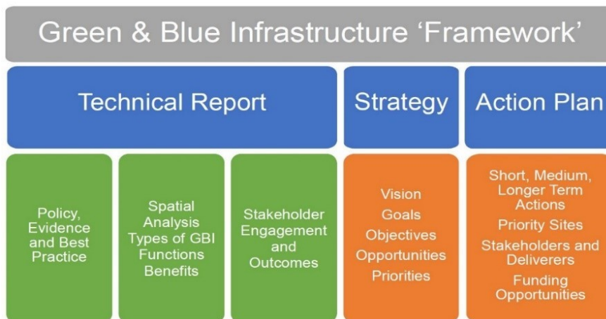
Figure 2 Green and Blue Infrastructure Framework taken from the Open Space Technical Report

3.17 The Open Space Assessment notes that approximately 74% of Blackpool is developed and that there is limited open space in Blackpool, with some wards having the lowest provision in the UK.