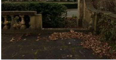
Missing balustrade on café terrace

issue raised in public consultation responses. The toilet facilities provided near to the visitor centre and bowling greens are closed by 3.30 p.m., and the only other facilities within the park are in the café, which itself closes at