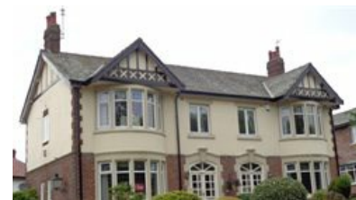
Attractive and well-maintained pair of semi-detached houses on North Park Drive