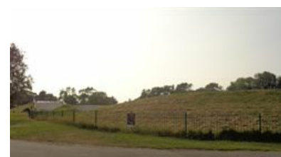
View of BMX track from East Park Drive