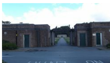
Male and female toilets at the entrance to the bowling greens