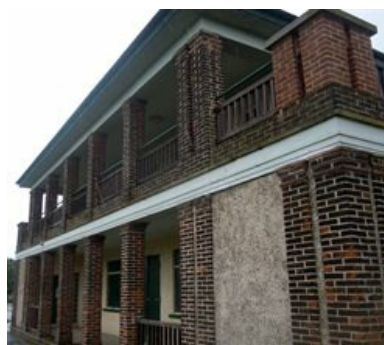
Former disused tennis pavilion which suffers from repeated vandalism