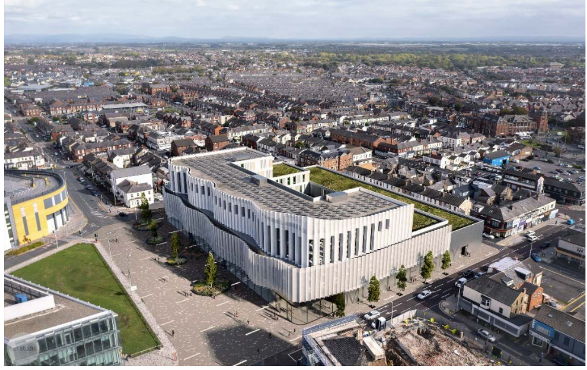
Page 42 of 46