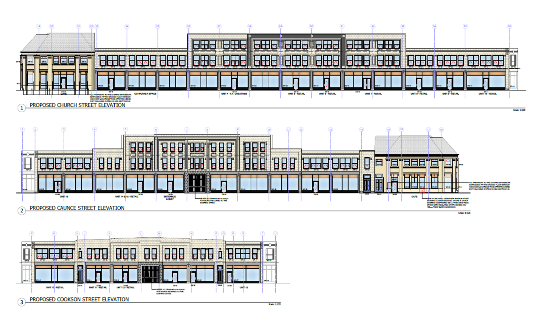
Page 24 of 46

8. Latest Scheme Images (Elevations shown below)