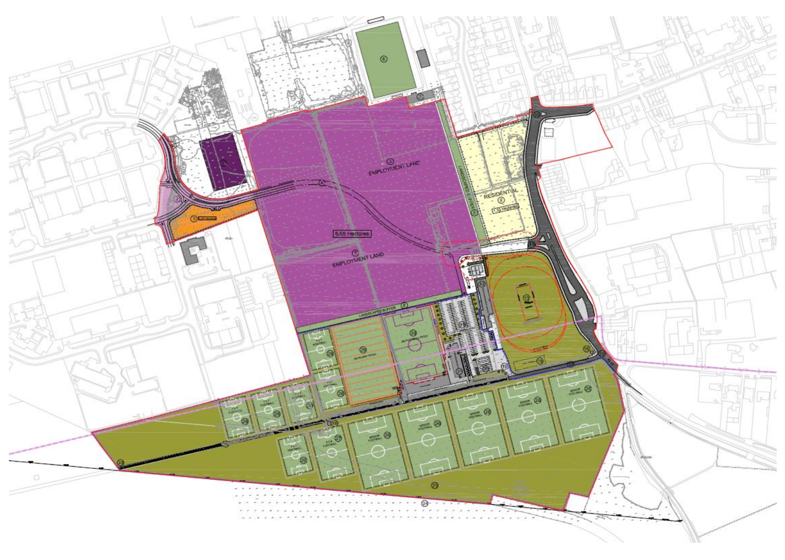
Page 20 of 46