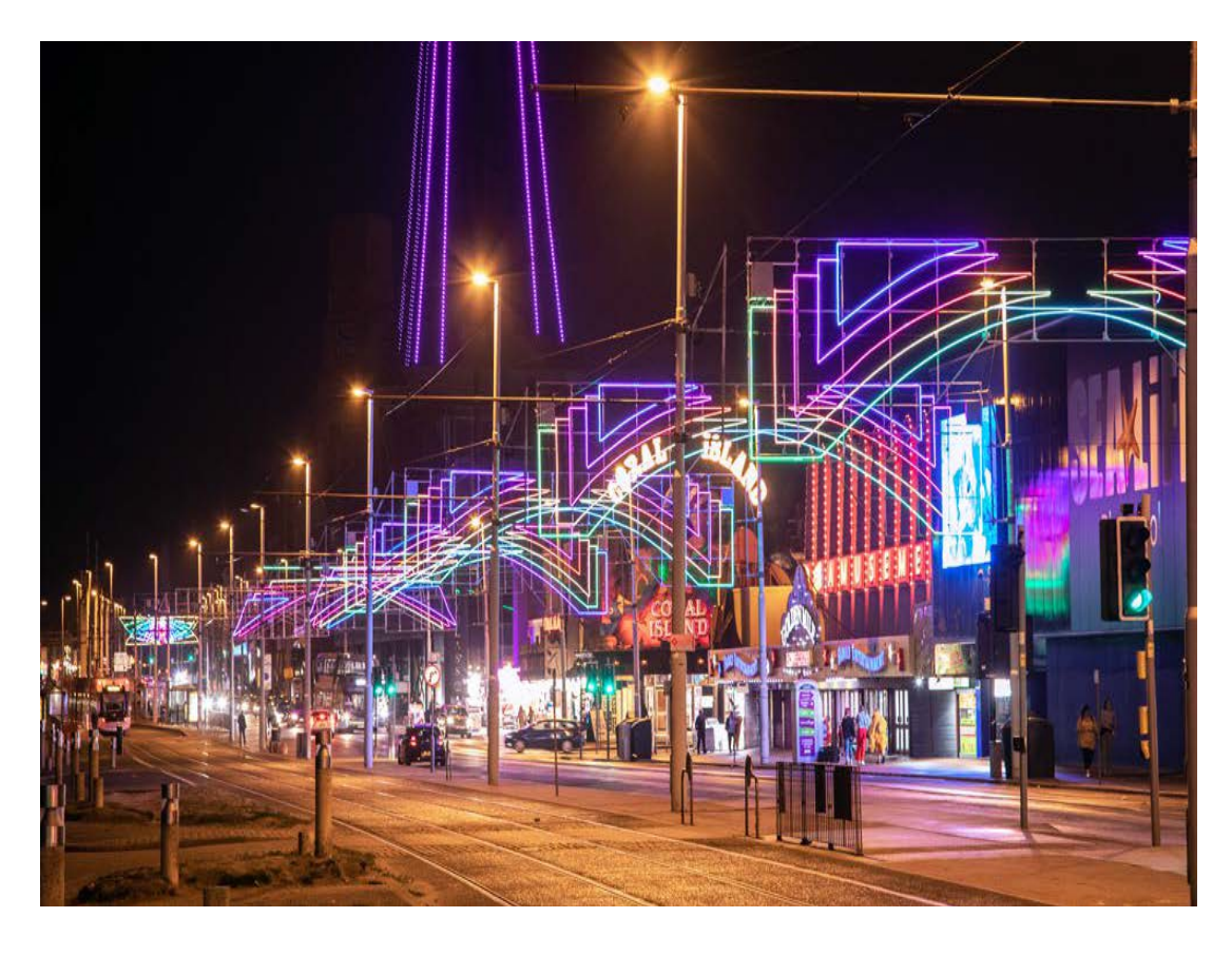
Page 30 of 46