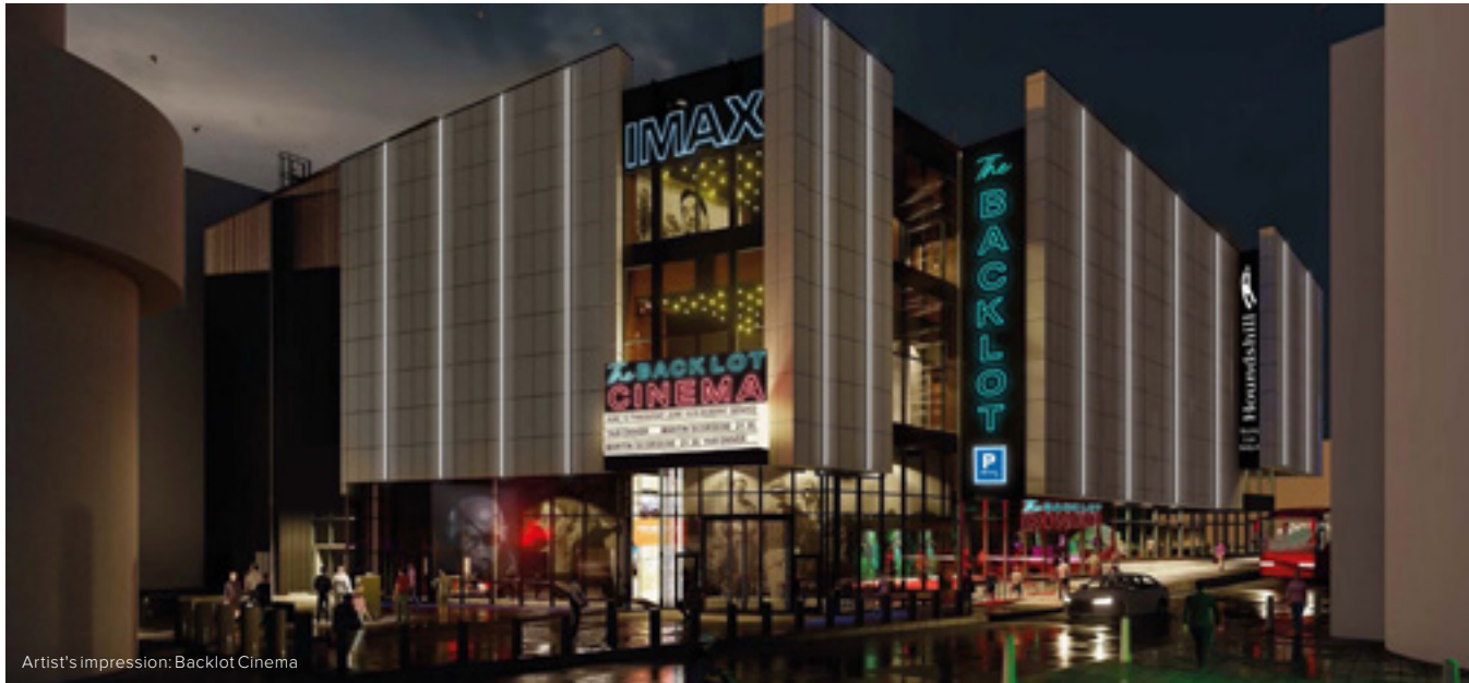
Artist's impression: Backlot Cinema