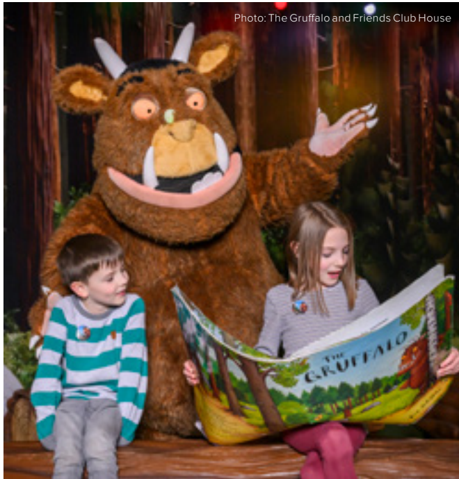
Photo: The Gruffalo and Friends Club House