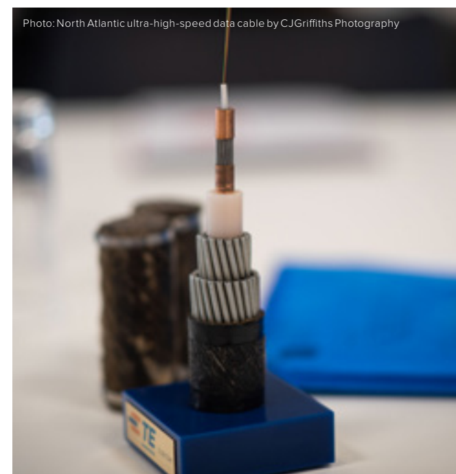
North Atlantic ultra-high-speed data cable