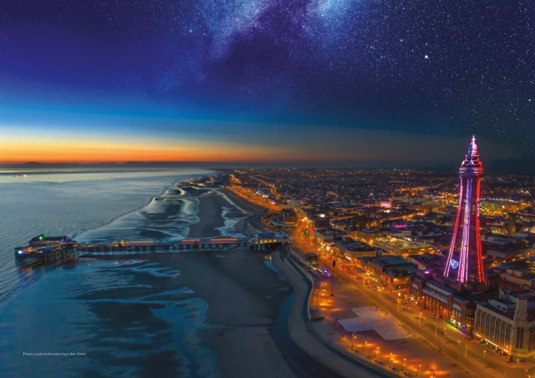
Look to the stars