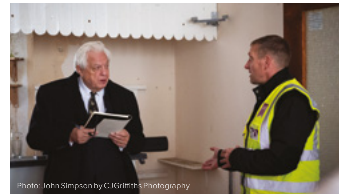
Photo: John Simpson

I spent a fascinating and moving couple of days in Blackpool where I was born as a wartime refugee. It has some of the worst social problems in the UK, but it also has teams of deeply impressive, dedicated people who are working hard to solve them.