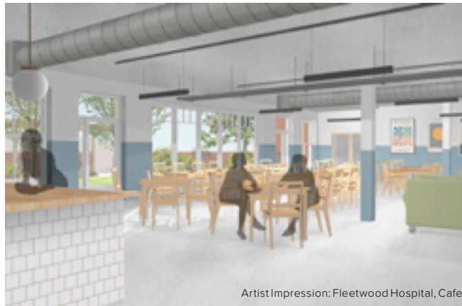
Artist Impression: Fleetwood Hospital, Cafe

To complete the ground floor vision, a café and community rooms will open soon, along with a new Youth Hub (under construction), which will be run by Fleetwood Town Community Trust. Macmillan Cancer have brought much needed support to the community for both cancer patients and their families. North West Ambulance Service are also moving into the Hub.