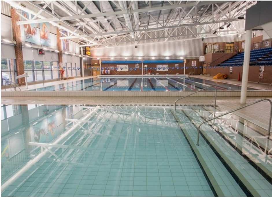
Palatine Swimming Pool