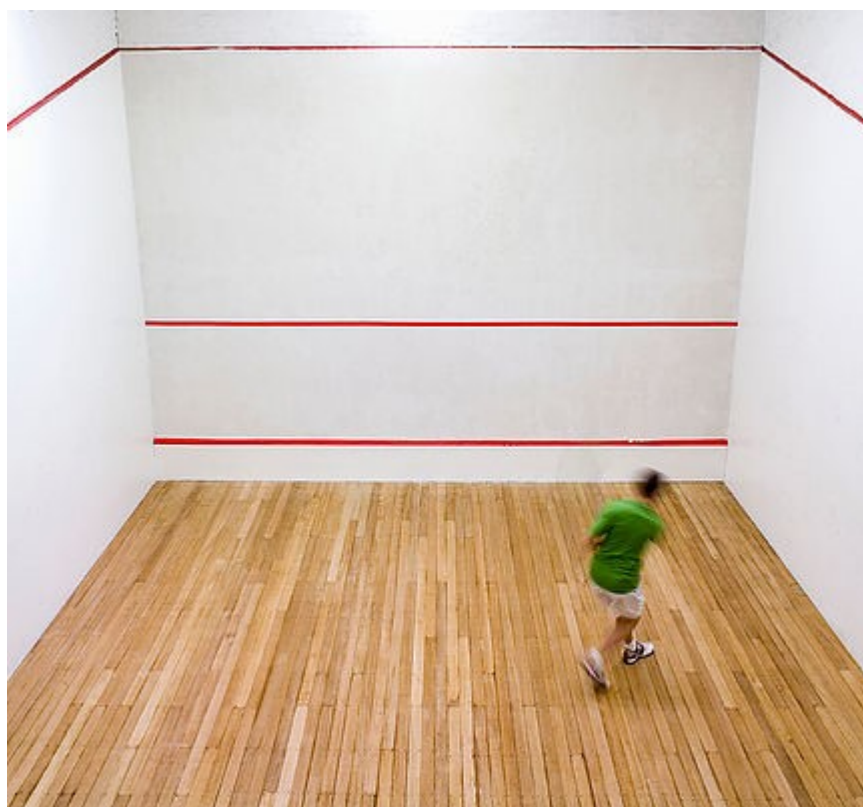
Squash Court at Blackpool Cricket Club

4.41 Even though no requirement for further squash courts has been identified at this stage, it may be necessary to support or upgrade existing public facilities during the plan period.