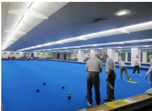
Blackpool Indoor Bowls Centre

4.16 There are no indoor bowls facilities within the borough. Blackpool Indoor Bowls Centre at Newton Hall Holiday Park is located just outside the borough in Fylde which is also home the Blackpool Indoor Bowling Club.