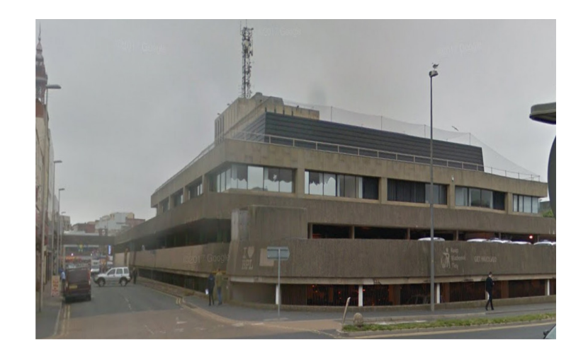
Chapel Street Elevation