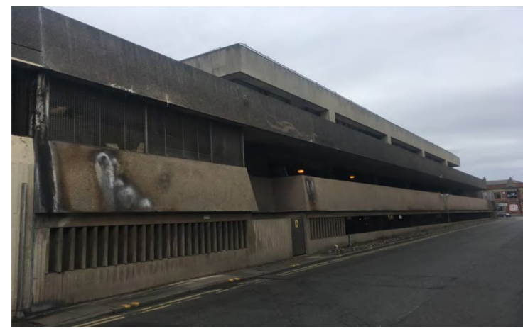
Bonny Street Elevation