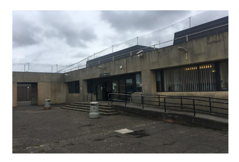
Mezzanine Floor Entrance