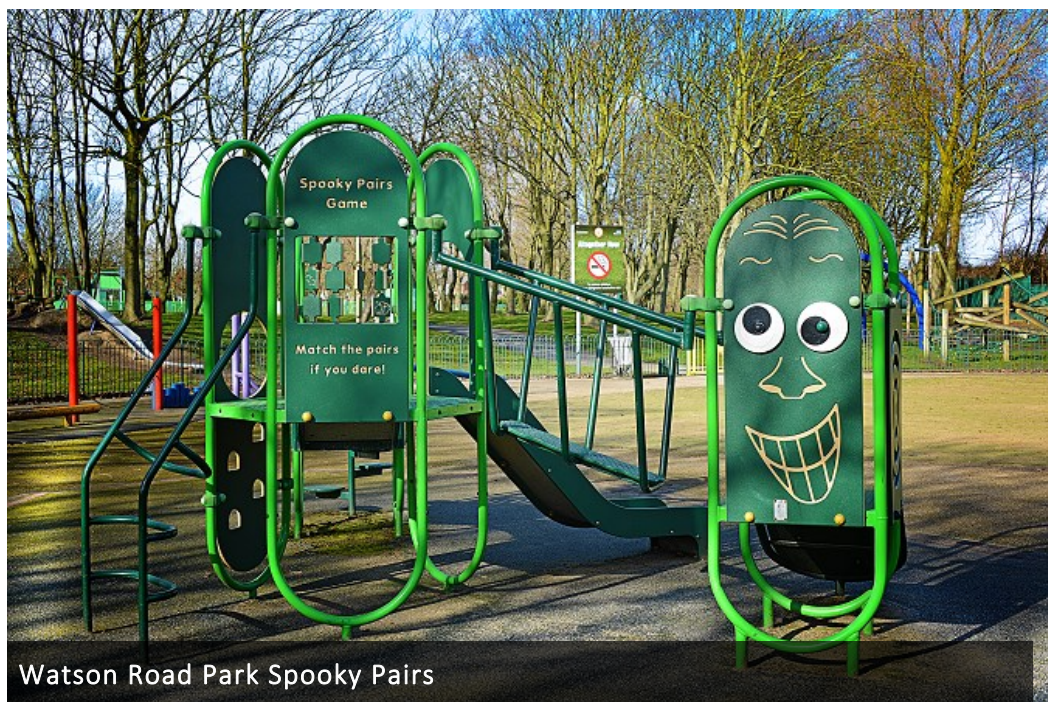
Watson Road Park Spooky Pairs